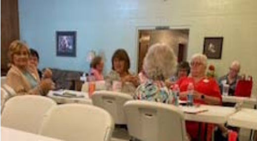
Several Units Represented

What a Great Turnout we had at the President's Roundtable!