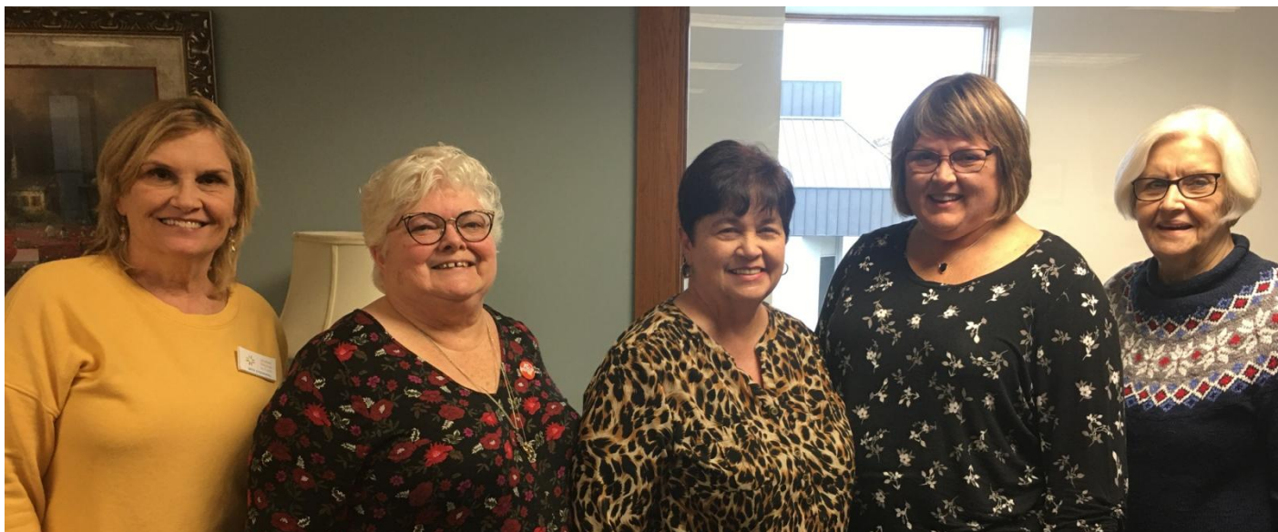
2023 Harpeth River District Officers at the Conference Training Event