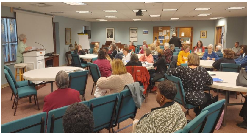
Conference & District Officers during opening remarks.